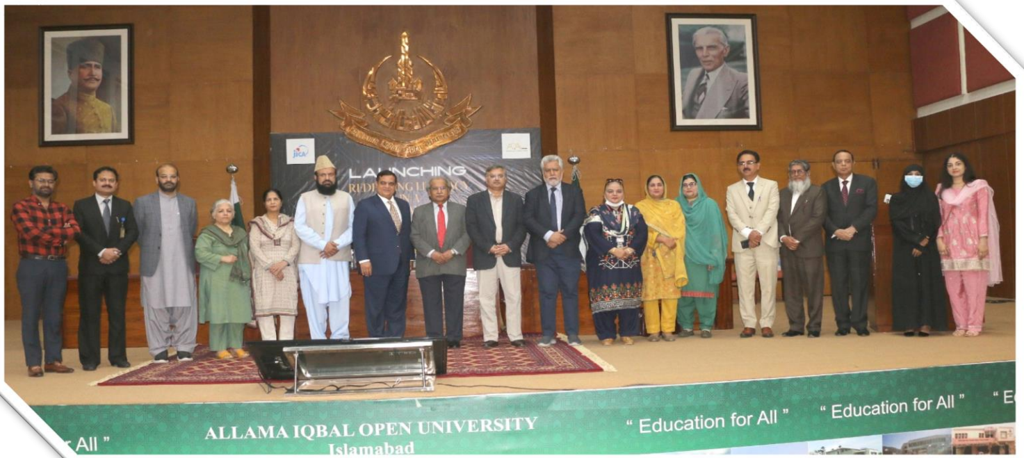
Group Photo, 20 th NACTE Council Meeting, held on March 16, 2023 at AIOU, Islamabad