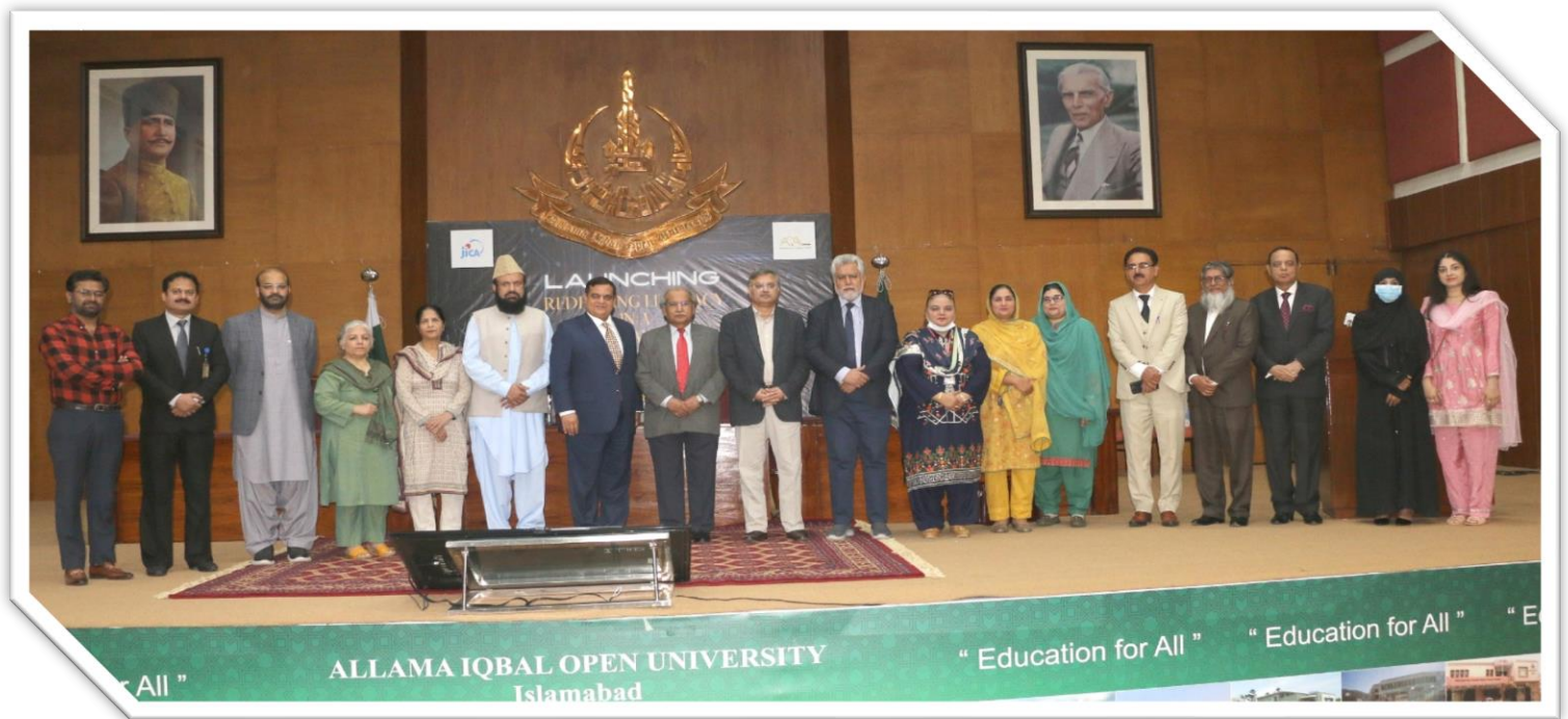
Group Photo, 20 th NACTE Council Meeting, held on March 16, 2023 at AIOU, Islamabad